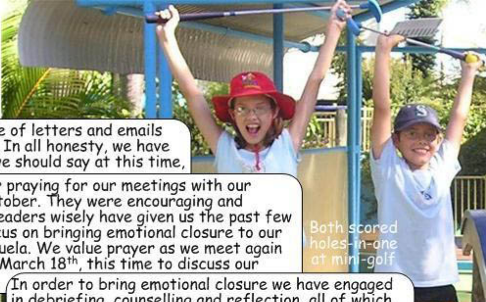
Both scored holes-in-one at mini-golf